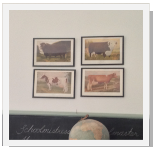
1930's prints of cattle at the Schoolhouse

It is always a pleasure to share information about The Old Britannia Schoolhouse and its programme with the fair goers. Quite a few young people tell us they have visited with their class and are eager to share stories about their day there. Many people, of course, know about the schoolhouse already but others we talk to have never heard about the schoolhouse or its program and are fascinated.